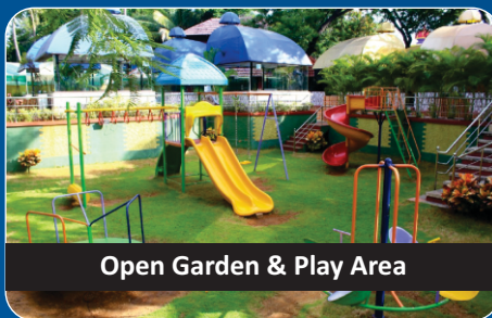
Open Garden & Play Area