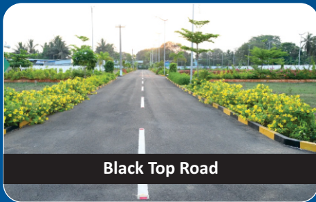
Black Top Road